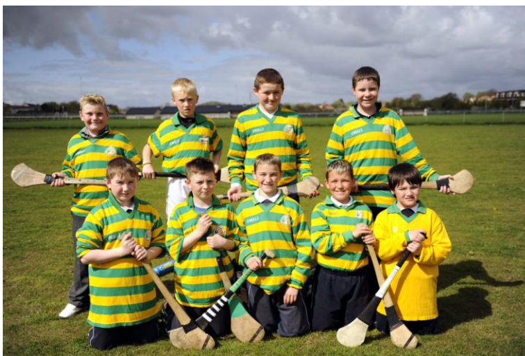
Players at the 'Have a Go' Blitz in Mahon