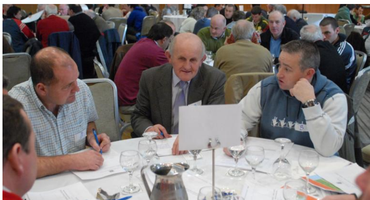
Pic: Delegates at the November 22 nd meeting

Many valuable contributions were made in areas such as club structures, fixtures planning, marketing, attracting and retaining volunteers, among others, and all will be considered as part of the Strategic Planning process.