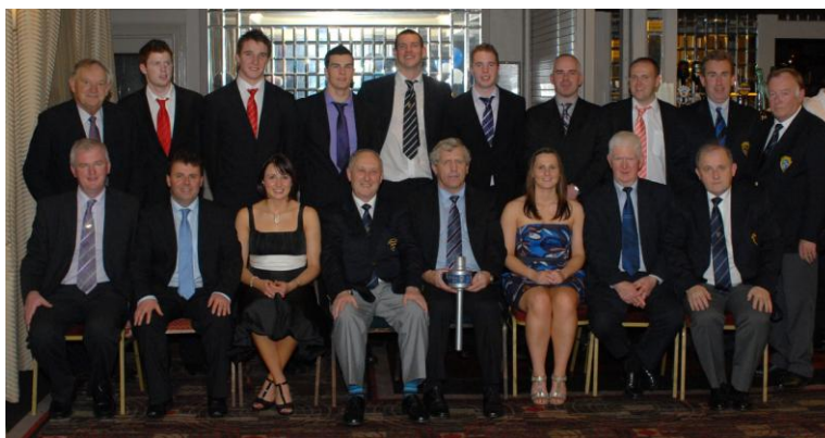
The Cork winners with officers of the Munster Council and Cork County Board.

Congratulations to all the Cork award winners at the Bórd Gáis Munster GAA Awards, which were presented at a gala banquet in Lawlor's Hotel Dungarvan on Saturday, December 5th.