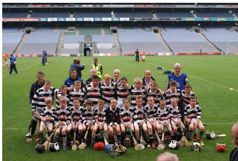
The Ballyhea U12s in Croke Park

The clubs qualified for this trip through a draw held for clubs who host a VHI GAA CUL Camp and who have not already been to Croke Park, with one team being picked from each of the eight divisions.