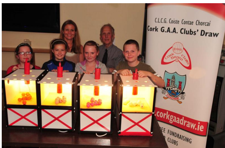
Pictured at the July Draw hosted by Kilbrin