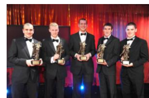
Cork's 2009 Football All-Stars

If your club wishes to obtain some of these posters, please contact the information Office at 021-4291604 or paircuirinn@gaa.ie