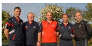
The Cork Minor Football Selectors

Congratulations to the Cork Minor Footballers, who reached the All-Ireland Semi-Final with a dramatic victory over Armagh on Sunday. While the Orchard County dominated the first half, Cork never gave up and claimed victory with a late goal, 3-11 to 0-19. They now meet Galway in the Semi-Final, August 29th .