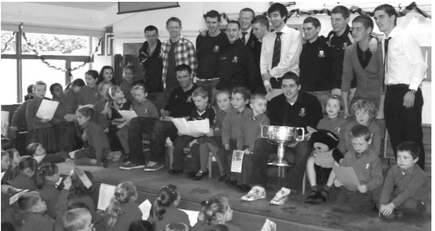
Holy Cross N.S.