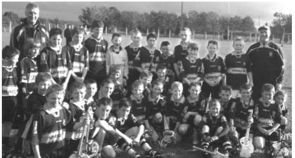
U-12 County Champions