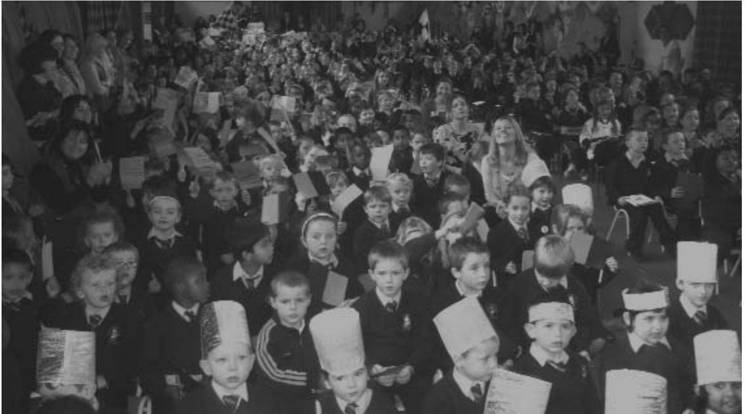
County Final St. Olivers