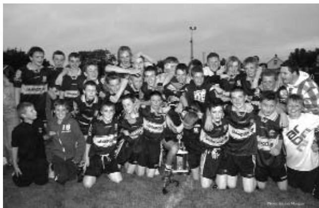
U-14 East Kerry Champions