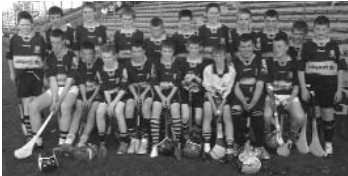
U-14 County League Champions