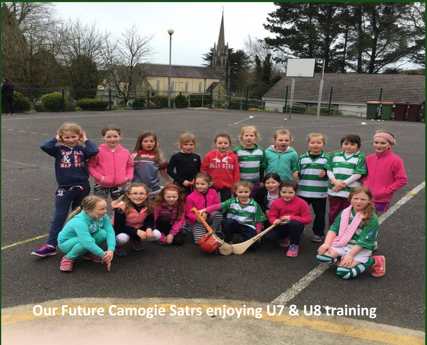
Our Future Camogie Satrs enjoying U7 & U8 training

Valley Rovers would like to thank you for supporting this fundraiser again this year and we're sure it will be as enjoyable as last year.