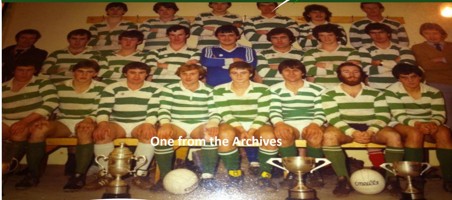
One from the Archives