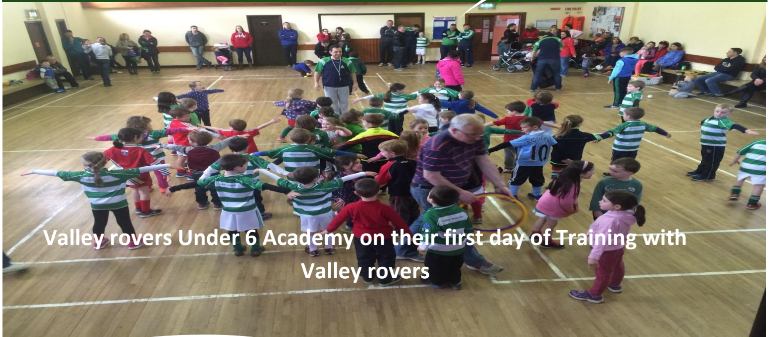
Valley rovers Under 6 Academy on their first day of Training with Valley rovers