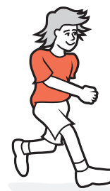
walking a dog!