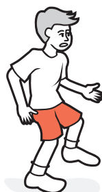
in a graveyard at night ...